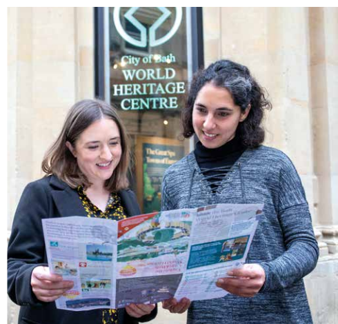
Left: Investigation Zone, Clore Learning Centre Above: World Heritage Centre