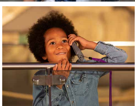
Above: Our children's audio tour is narrated by Michael Rosen

of informative audio guides in 12 languages, as well as children's versions, CGI projections and reconstructions throughout the exhibitions. So, you can really get a feel for what life was like in Aquae Sulis, not to mention what visiting Romans got up to during their time at the baths.